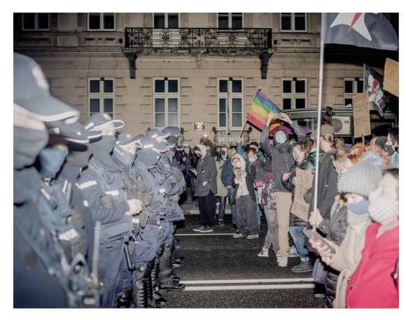
Figure 3: A scene from one of the protests in Warsaw.

What the above has illustrated is that simultaneously we were seeing, subjectively when considering a shift towards the left as positive, progressive narrative shifts and regressive narrative shifts. A movement does not have an inevitable path — events and actors within and around it can influence its development.