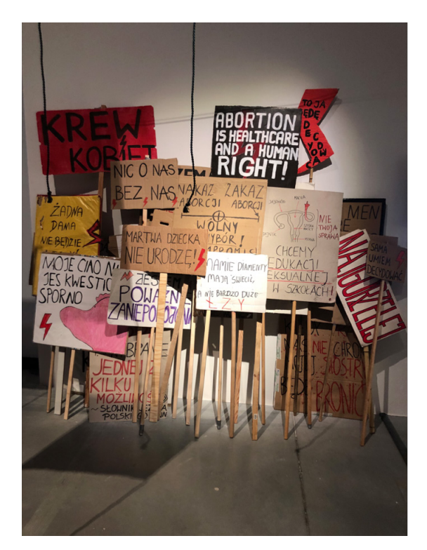
Figure 10: Warsaw Museum of Modern Art.

Write the History of Tears: Artists on Women's Rights". As part of this exhibition, they included the same protest signs in a white cube setting. In a recent discussion-interview published by Magazyn Szum, several activists and thinkers criticised the exhibition for focusing on 'tears', the idea of victimhood, and weakness, as opposed to broadening the scope of the exhibition into a diversity of experiences of people who have abortions, and reflecting the unsanitised, messy, joyful, rebellious, and chaotic experience of the performativity of the protests.[15] This situation sparks the question as to who should be collecting archival materials of the movement and constructing the narratives around it; the curators of this exhibition were criticised by those who have been deeply involved in the protests. Nevertheless, the signs were displayed in the Museum without an artist name - echoing the notion that everybody was an artist during the 2020/21 protests.