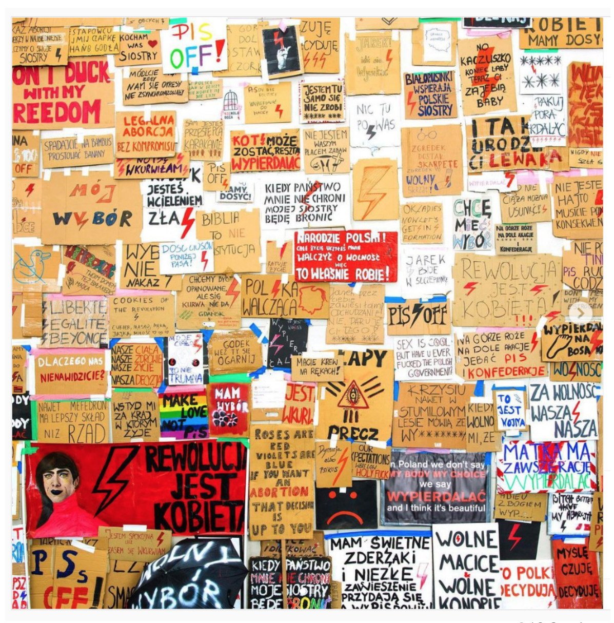
Figure 11: Screenshot of artist Krzysztof Powierża's Instagram account depicting the censored artwork

due to the dynamic nature of social movements and the lack of structure and financial support — how can we resolve this issue? Secondly, they confirm that physical archives require capital, and therefore institutions. But how can this be done when the capital required could come from few other sources apart from state funding, when the state is greatly concerned with national memory politics and is ideologically opposed to this movement and its demands? If art from within protests is about knowledge-development,