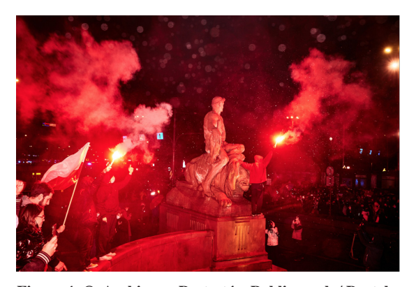
Figure 4: © Archiwum Protestów Publicznych / Bartek Sadowski

Alongside the reclaiming of public space by the sheer presence of bodies in the streets, in and of itself an act of resistance, there were broader artistic methods used for the same purpose. Some of these included stickers, billboards with the phone number of the grassroots initiative Abortion Dream Team, projections, (often humorous) costumes, and graffiti — all of which can and should be considered as art. The OSK logo, which includes the symbolic red lightning bolt, was also everywhere; the logo is black, white, and red — the white and red deeply entrenched in the Polish consciousness as the national colours, and the black arguably continuing the legacy of the Black Protests. The red flare was (re)claimed by the Strajk Kobiet protesters too, building towards the overarching question raised by the protests: who does Poland belong to?