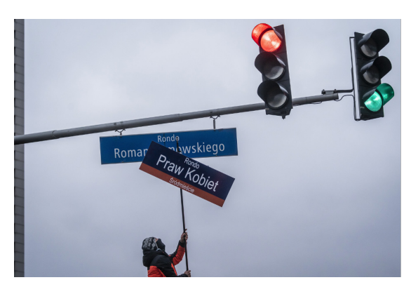
Figure 5: Activist changing the name of the Dmowski Roundabout.

with activists mounting self-made signs to mark the name change; the petition to make the name change official was approved in December 2021 by the Warsaw Council and is currently awaiting further legal steps; in Kraków a square opposite a PiS party office has already been officially renamed to the Skwer Praw Kobiet [Women's Rights Square]. In a country in which the majority of public sites are named after religious, political, and military figures — you would be hard pressed not to find a street named after the General Józef Piłsudski or Pope John Paul II in any Polish town – these symbolic changes signal small steps towards carving out alternative sites for public memory.