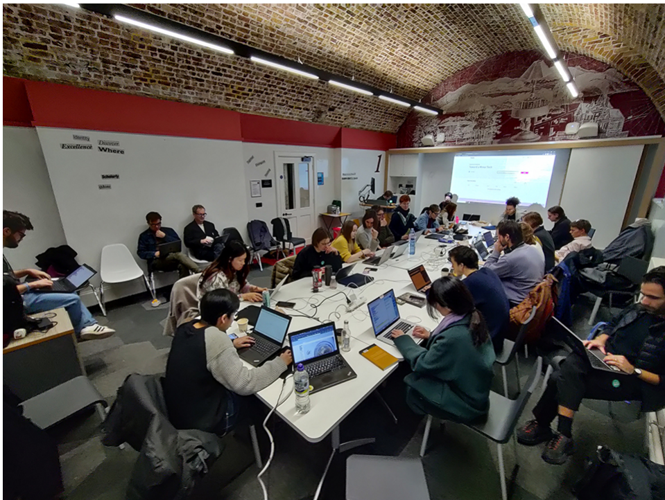
Figure 1: Workshop at King's College, January 2023.

A characteristic of a minor technology is that in it everything takes on a collective value.