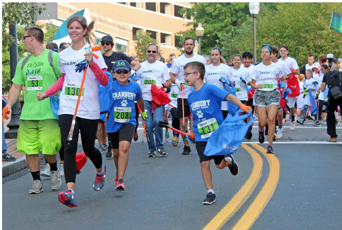
Figure 6: The start of the 2020 Trash Dash, a plogging fun run; Keep America Beautiful, Inc., 2020, Keep America Beautiful , https://kab.org/kab-events/trashdash/event/

100% renewable energy goal in late 2014 under public pressure. Yet, since then, it has expanded its data centre operations, but stopped all renewable energy investments after the 2016 wholesale electricity price dropped (Cook and Jardim 4).