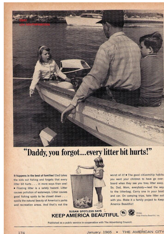
Figure 1: A 1965 Keep America Beautiful advertisement featuring Suzy Spotless saying: “Daddy, you forgot... every litter bit hurts!”; Keep America Beautiful, Inc. and Advertising Council. Photograph. The American City , January 1965, Ebay, https://i.ebayimg.com/images/i/352723715470-0-1/s-l1000.jpg .

A lockdown meant working from home when possible, drastically decreasing air and car travel. Remote work became the emblem of sustainable working: less travelling meant less CO 2 , nitrogen oxide, carbon monoxide, and other polluting emissions. This temporary clearing of the air was made possible by the uptake of video conferencing and the goodwill of all those subjected to it. Platforms such as Microsoft Teams, Skype, Zoom and Google Meet embraced the explosion in demand. Overall Internet traffic volume increased with 15–20%, applications for remote working and education even saw increases beyond 200%. During the first lockdown, while network service providers were still busy upgrading the capacity of network bottlenecks, glitchy video streams and malfunctioning educational platforms were of the order of the day. Overall Internet infrastructure was able to handle the rapid