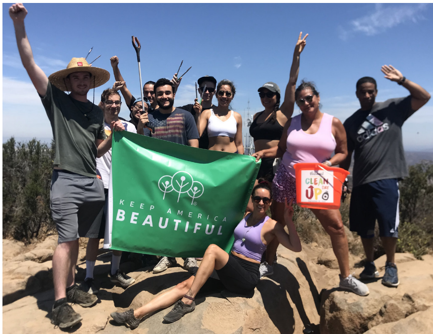
Figure 7: A group of enthusiastic Keep America Beautiful volunteers during a 2021 cleanup; Nelson, Ben, Cleanup group for Keep America Beautiful, 2021, Wikimedia, https://commons.wikimedia.org/wiki/File:Keep_America_Beautiful_Cleanup_Team.jpg .

used. We are still reaping the rewards, picking up after ourselves, updating our hardware, lowering the thermostat, hiding our messy office behind a virtual background.