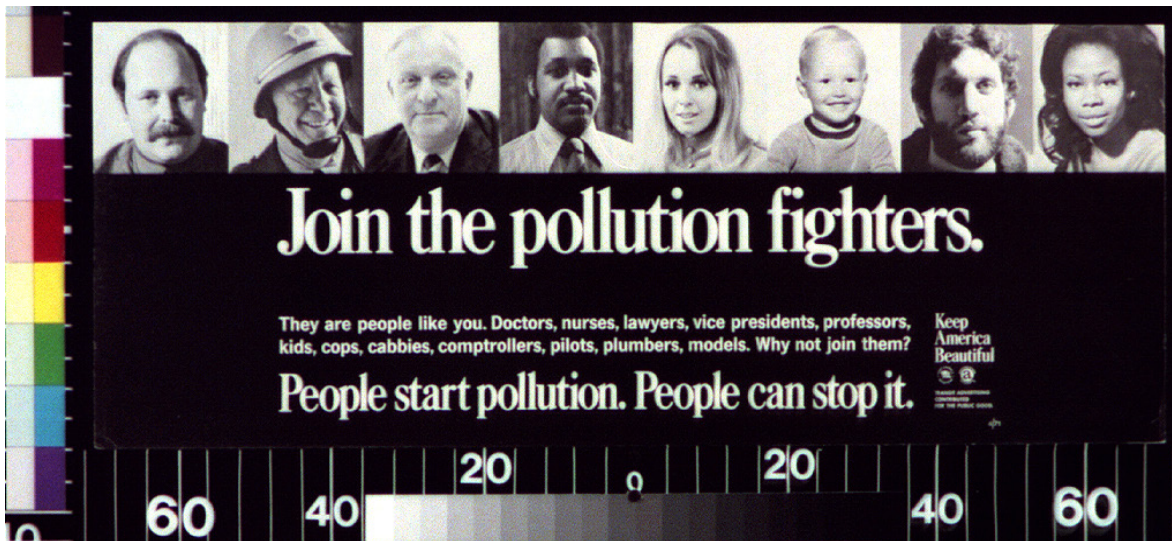
Figure 3: A 1971 Public Service Announcement by Keep America Beautiful, emphasizing individual guilt and responsibility; Keep America Beautiful, Inc. and Advertising Council. Join the Pollution Fighters . Library of Congress, 1971, www.loc.gov/item/2016649872/ .