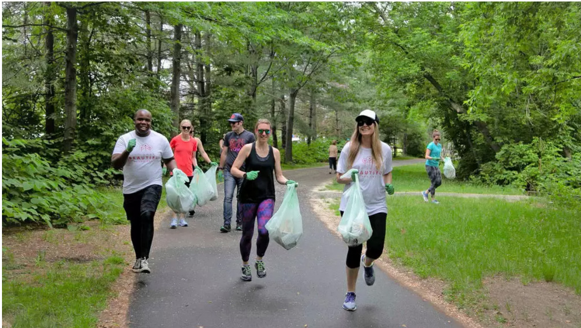
Figure 5: The Saucony and Keep America Beautiful Cleanup Run; Keep America Beautiful, Inc. June 2018, Keep America Beautiful , https://kab.org/keep-america-beautiful-plogs-with-saucony/

and ‘dematerialization’. The third phase, Sustainable ICT, shifts its focus even more, emphasising the potential of ICT to not only improve sustainability, but also economic and societal issues in the countries that can afford this (ibid.). In practice this means other countries are burdened with the environmental footprint that the production of such ICT involves. There is no real distinction between Sustainable ICT and regular ICT practices. Green ICT can therefore be described as a business strategy used to gain a competitive advantage and its description matches Google, Amazon and Microsoft’s ‘sustainability’ practices perfectly.