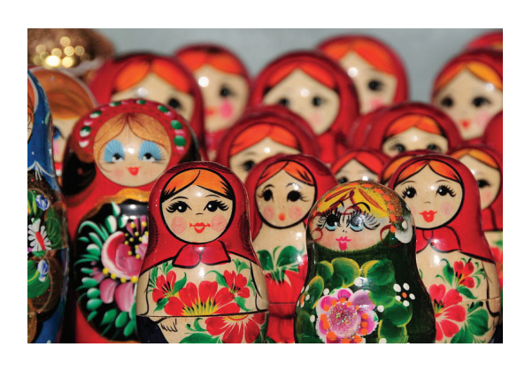
Figure 2: Marcosleal. "Matryoshka dolls in street fair – Budapest". Photograph. 2008. Matryoshka dolls in Budapest.jpg. Wikimedia Commons. Web. 29 Sep. 2013.

Soon after Git was released, GitHub [11] appeared. Using the apparatus (the 'plumbing and porcelain') which comprises the Git software, GitHub establishes a web-based repository for software projects whose source code is released in the public domain. GitHub has been adopted by a huge and rapidly expanding user community, as a platform for developing and publishing software and a range of other creative works. GitHub provides a large-scale, distributed means to recognize and pin point different stages in the production of these works. It has also become home to a mass of never changing, user-generated software configuration files. In GitHub these can be Git configuration files, stored in a Git repository, on a platform built using Git.