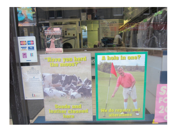
Figure 8: Advertisement posters for a dry cleaner's shop, apparently inspired by Internet memes. Edinburgh, 2013.

As images and self-images re-instate a sense of place, absent themselves from rhetoric and generate their own associations, they obtain a peculiar sense of agency. They are re-entering the world as prosaic reminders of the real — hermetic emblems of an already present, post-ironic post-digital age: