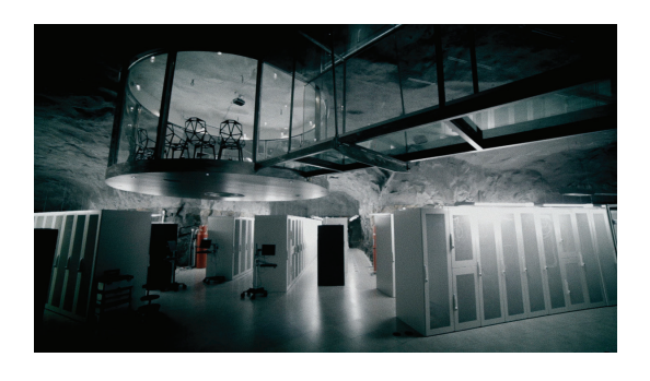
Figure 6: Shockblast underground data centre. Photograph. n.d. TPB:AFK watch.tpbafk.tv. Web. 29 Sep. 2013.

in a deserted basement of The Guardian's King's Cross offices, a senior editor and a Guardian computer expert used angle grinders and other tools to pulverise the hard drives and memory chips on which the encrypted files had been stored. As they worked they were watched by technicians from Government Communications Headquarters (GCHQ) who took notes and photographs... (Borger)