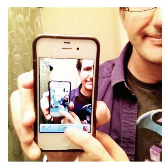
Figure 7: Mekhitarian, Vahram. "Recursive Cell." Photograph. 2013. File:Recursive Cell.jpg Wikimedia Commons. Web. 10 Jan. 2014.

my proliferation of selfies is a small way of fighting back. The more I look at myself (in a mirror or in pictures), the easier it becomes to accept that this is really me, and this is my skin... I feel that the more pictures I post of me, sure I'm putting myself out there to be judged, but I am also adding to images out there (in the minds of friends and strangers alike) of who I am. (Stuficionado)