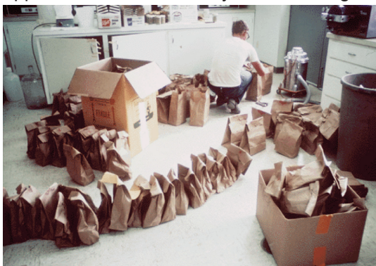
Figure 4: Processing of replicate biomass samples, ready for drying and weighing, in the field laboratory at the CPER/Pawnee grassland site, Colorado, USA. Credit: Larry Nell, Colorado State University, July 1971.

Despite this labor, the Grasslands model, like similar large-scale ecological modeling programs of the time, revealed very few new ecological principles. Deemed “too simplified biologically” despite implementing an unprecedented number of variables (Coupland 154), the model was built with an assumption of default equilibrium. Coupland argues that the Biome Model was simply “a sophisticated version of a cybernetic system [...] and cast [...] the ecologist in the role of systems engineer” (146). The project disproved its foundational hypothesis – that complex ecological realities can be reconciled with mathematical models and be described as abstracted structures of inputs and outputs. “The grandiose ideal of achieving total control over ecosystems, which around 1966 appealed so much to systems ecologists