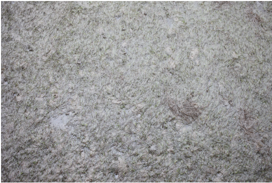
Figure 1: Seagrass in Tasmania, Australia.