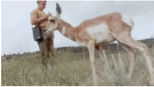
Figure 5: Deer observations made at the CPER/Pawnee grassland site, Colorado, USA. Credit: Animated GIF made from Adam Curtis' documentary All Watched over by Machines of Loving Grace .

It is also worth emphasizing that these apps do not purport to replace human identification but rather facilitate human computer collaboration to reach conclusions quicker. This is significant, as it shows a way that AI can produce more meaningful environmental encounters rather than automate them away. This use case for AI also serves as a reminder that data can be much more than a material for building a simulation or instrumentalizing whatever is being measured. The act of data collection and collaborative identification can amplify encounters and, by extension, yield transformation or what artist Jenny Odell calls “a certain dismantling in the mind.” In observing a local bird, and being assisted to identify it as a magpie, I’m learning and tuning my perception to the lifeworlds I inhabit: I’m subject to transformation.