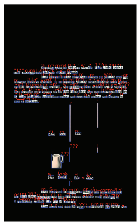
Figure 2: The Ways of Seeing book cover image seen through an optical character recognition program. Created by SICV.

In this sense, the knowledge produced is bound together with systems of power that are more and more visual and hence ambiguous in character. And clearly computers further complicate the field of visuality, and ways of seeing, especially in relation to the interplay of knowledge and power. Aside from the totalizing aspects (that I have outlined thus far), there are also significant "points of slippage or instability" of epistemic authority,[12] or what Berger would have no doubt identified as the further unsettling of the relations between seeing and knowing. So, if algorithms can be understood as seeing, in what sense, and under what conditions? Algorithms are ideological only inasmuch as they are part of larger infrastructures and assemblages.